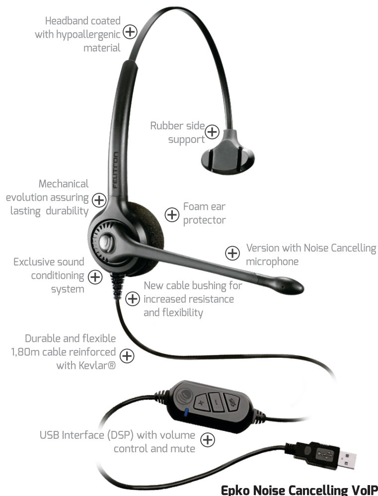
Epko Noise Cancelling VoIP