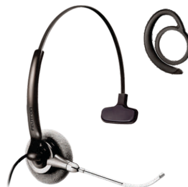
Stile Top Due Voice Guide