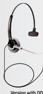
Version with QD