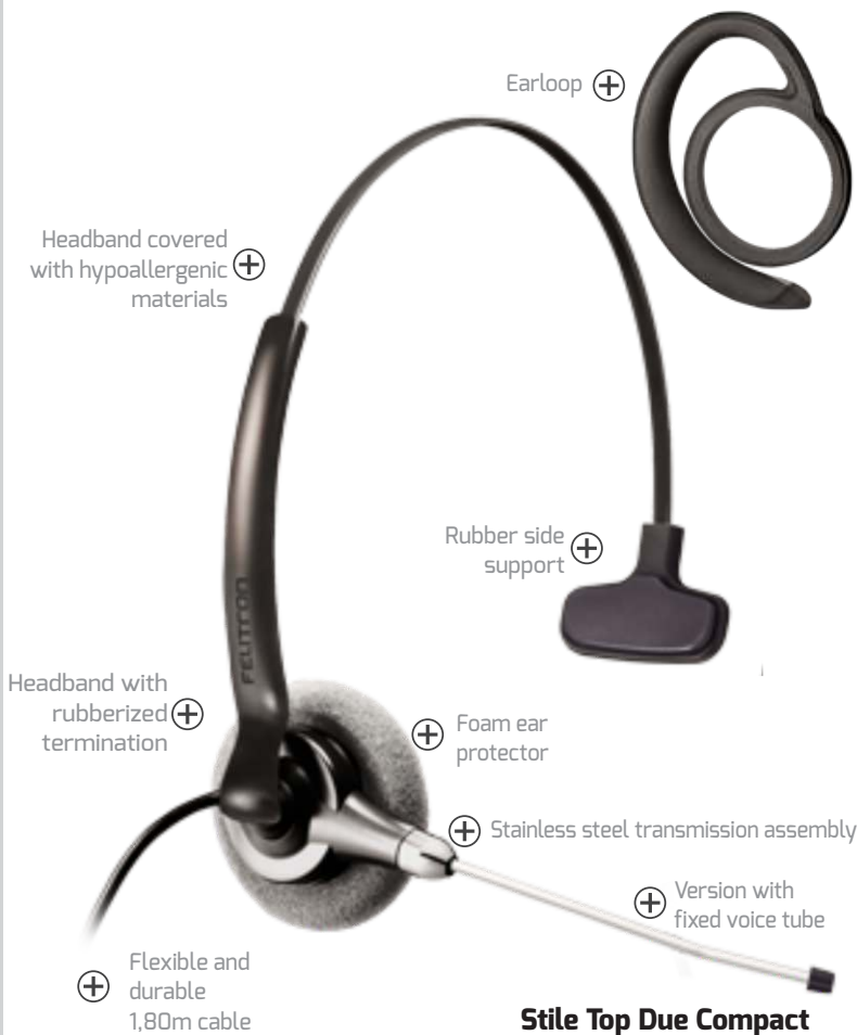
Stile Top Due Compact