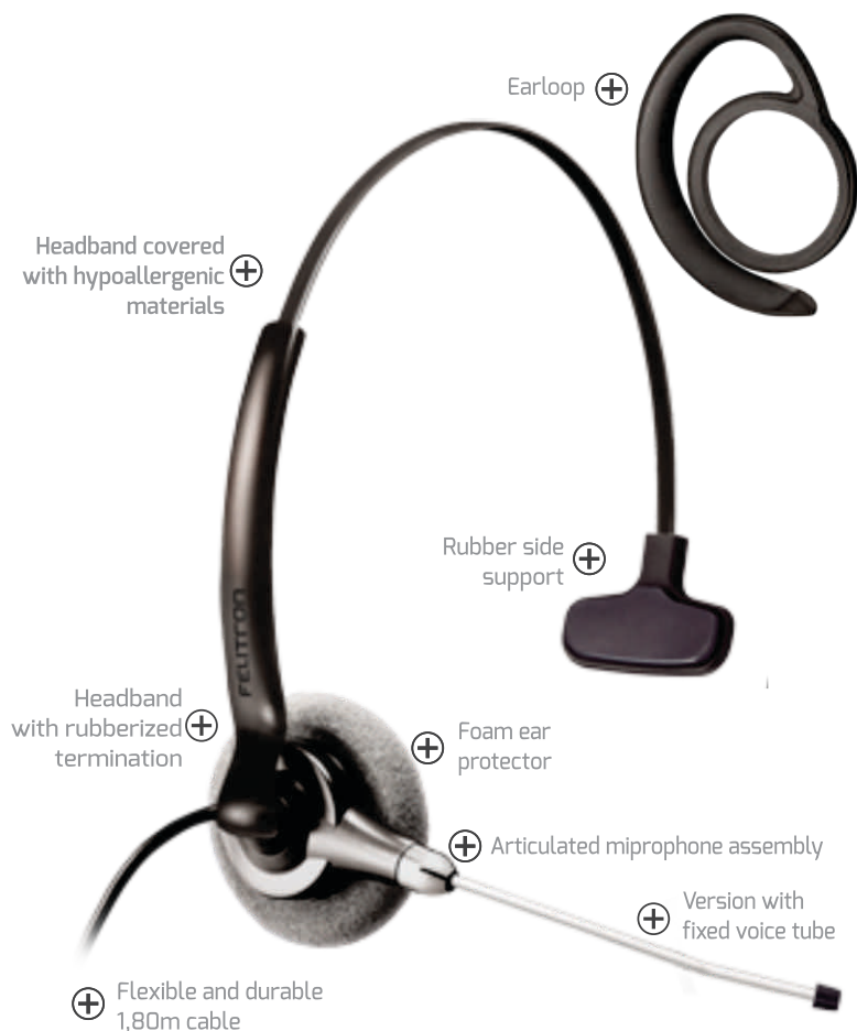
Stile Top Due Compact