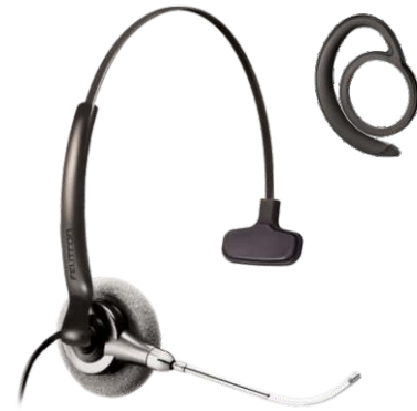
Stile Top Due Voice Guide