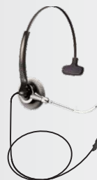
Version with QD