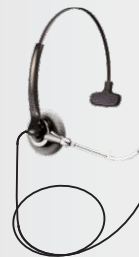
Version without QD