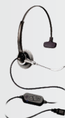
Version without QD