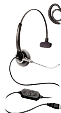
Stile Top Due Voice Guide VoIP Version replaceable voice tube