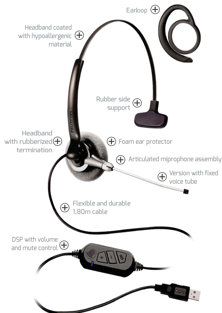
Stile Top Due Compact VoIP